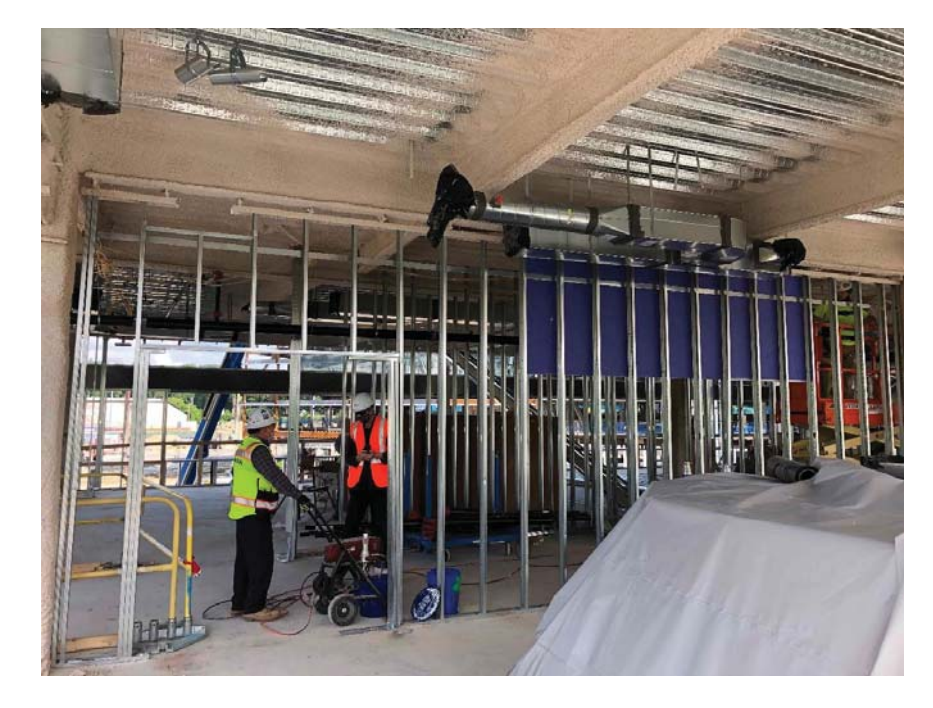
Photo 5 – Building A Corridor with MEP components, wall framing, and some sheathing installed.